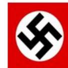
Above right: Swastika (symbol of Nazis)