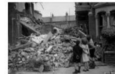
Below: Remains of a house after a bombing raid during the Blitz