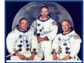
Buzz Aldrin, Neil Armstrong, Michael Collins.